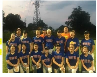
Randolph Co. Legion Lady Fastpitch Team